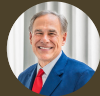
Governor Greg Abbott

I think the last option - maybe no option - should be ever taking somebody's land. And so I think the first thing that needs to be done is to explore all the other potential options.